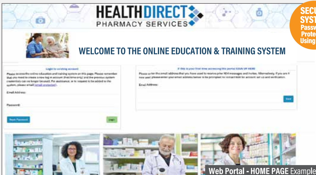
Web Portal - HOME PAGE Example