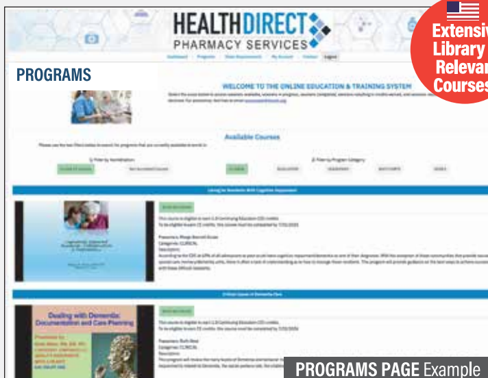
PROGRAMS PAGE Example